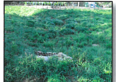
Picture taken 6 weeks after prescribed burn.

This year, the prescribed burn will occur around the parks and rear yard rain gardens (see attached map on the back of the letter for areas highlighted in yellow).