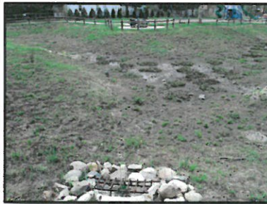
Picture taken 2 weeks after prescribed burn.