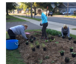
Haslett Community Church Pollinator Garden

F. GreenStop: Haslett Community Church: this site features a large solar array and several pollinator gardens. Additional native plantings have recently been completed. Alternative Return Route: This off-road alternative route runs through a diverse natural area behind Haslett High School.