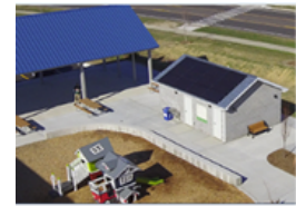
Market Solar Array

B. GreenStop: Lake Lansing Park South now features a bioswale and natural shoreline demonstration.